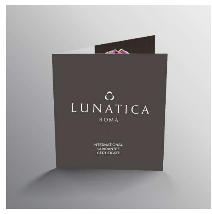
International Warranty and Insurance for theft and fire of every item sold

All this contributes towards the excellent ratio between quality and price of Lunatica jewellery.