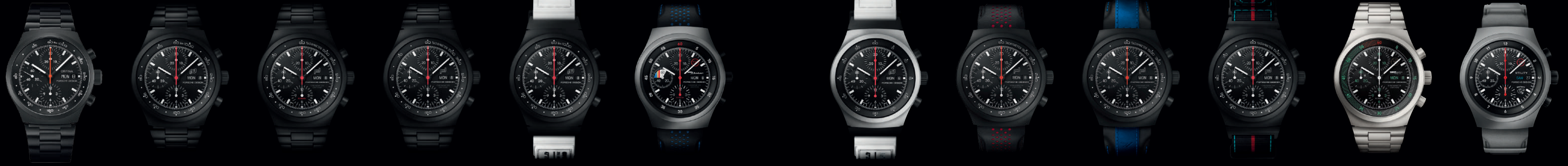
1972 2022 2023 Chronograph I Chronograph 1 – 1972 Limited Edition Chronograph 1 – 911 Edition 50 Years Porsche Design Chronograph 1 – All Black Numbered Edition Chronograph 1 – GP 2022 Edition Chronograph 1 – 911 Dakar Chronograph 1 – GP 2023 Edition Chronograph 1 – Ennstal-Classic 2023 Edition Chronograph 1 – Rennsport Reunion VII Edition Chronograph 1 – 75 Years Porsche Edition Chronograph 1 – 911 S/T Chronograph 1 Utility – Limited Edition