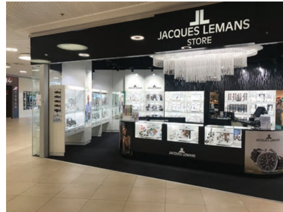
JL Store Center West Styria 8054 Graz