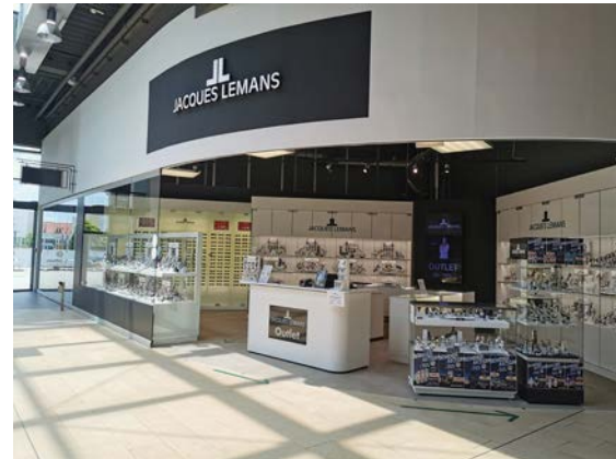
JL Store Parndorf Fashion Outlet Burgenland 7111 Parndorf