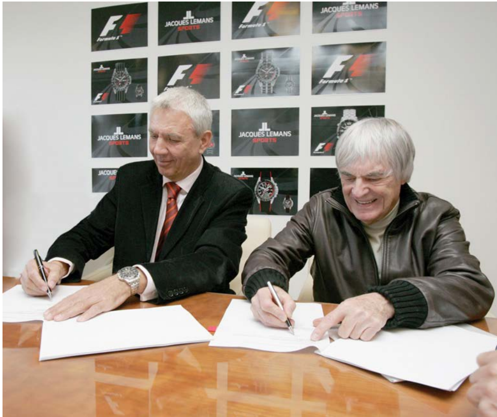
Alfred Riedl and Bernie Ecclestone signing the JL - F1 contract in Sankt Veit an der Glan

In 2006, Jacques Lemans proudly entered into an exceptional partnership with Formula 1, marking a historic moment as the first and only licensed watch Formula 1 has ever had. This collaboration added another illustrious chapter to our brand's history of global partnerships.