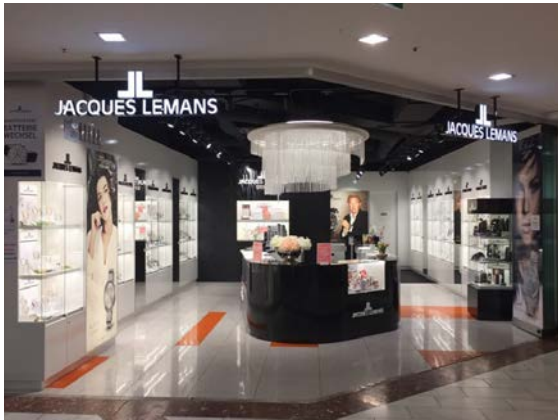
JL Store Lugner City Vienna 1150 Wien