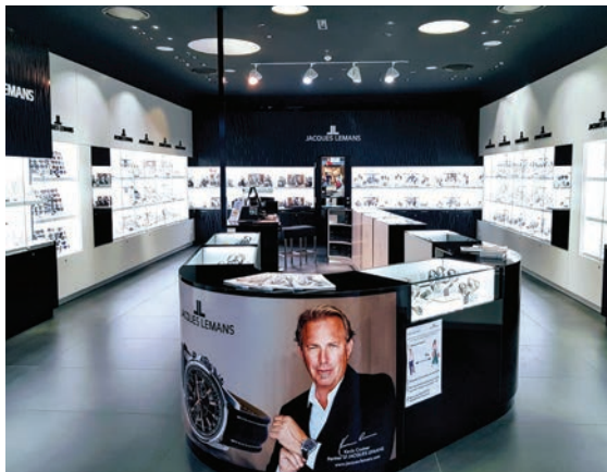
JL Store Atrio Carinthia 9500 Villach