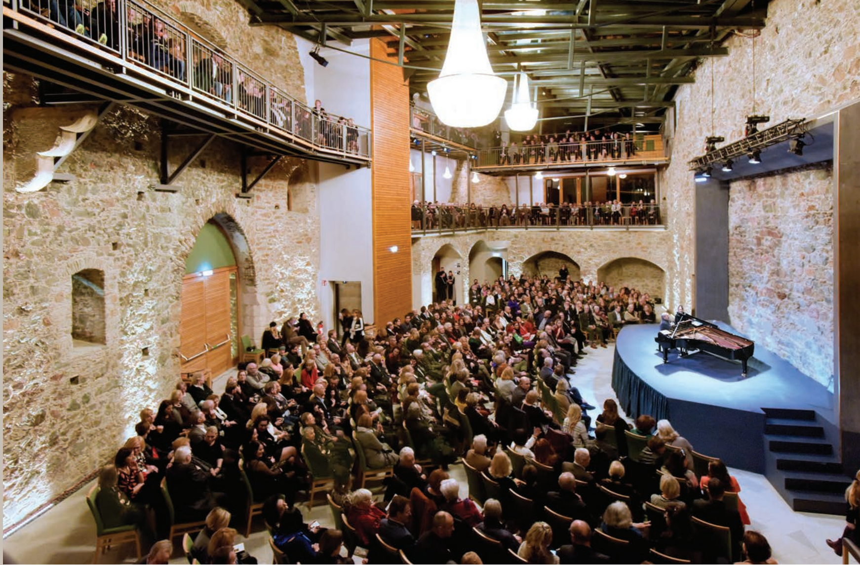
Taggenbrunn Castle - Festival Hall, © Ferdinand Neumüller