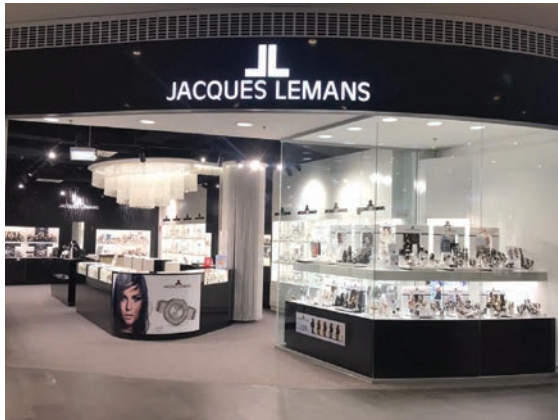
JL Store Murpark Styria 8041 Graz