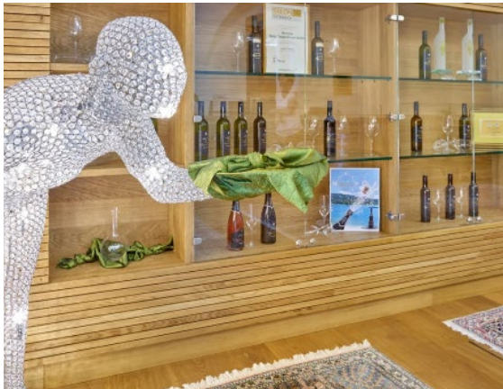
Burg Taggenbrunn Winery Carinthia 9300 St. Veit an der Glan