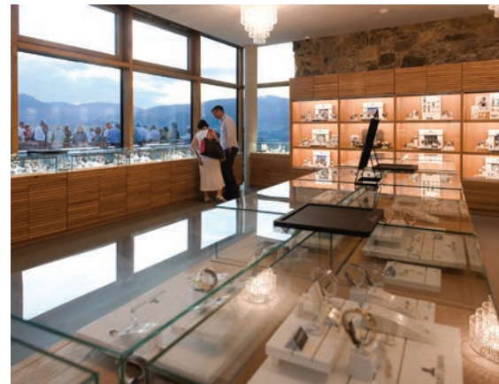
JL Store Burg Taggenbrunn Carinthia 9300 St. Veit an der Glan