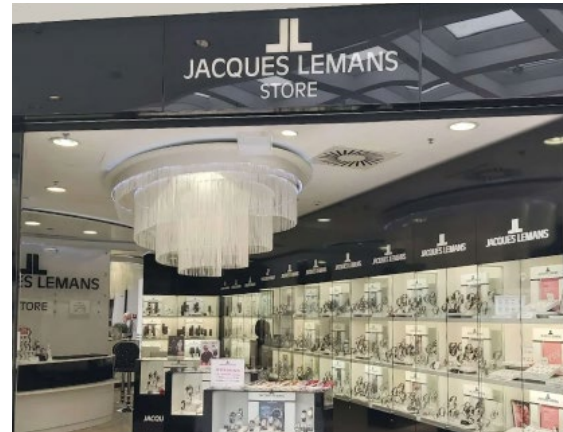
JL Store SCS Lower Austria 2334 Vösendorf