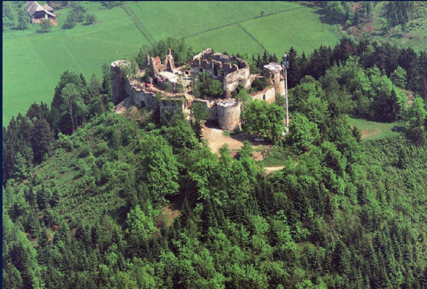
Taggenbrunn Castle at the reopening in 2019